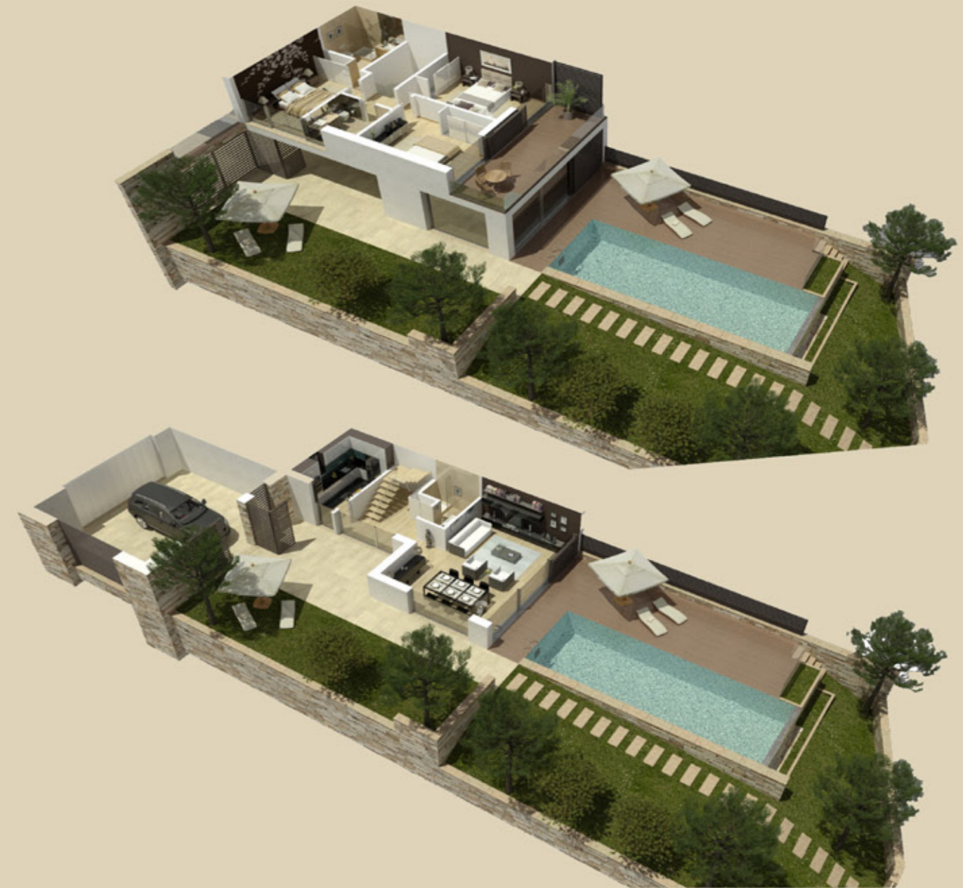
PLOT A - Gross Build Area* 347sqm